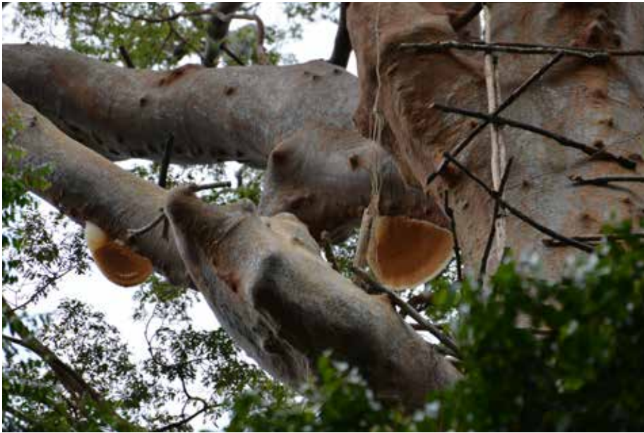
Above: Abandoned A. dorsata combs on the underside of branches after a honey harvest