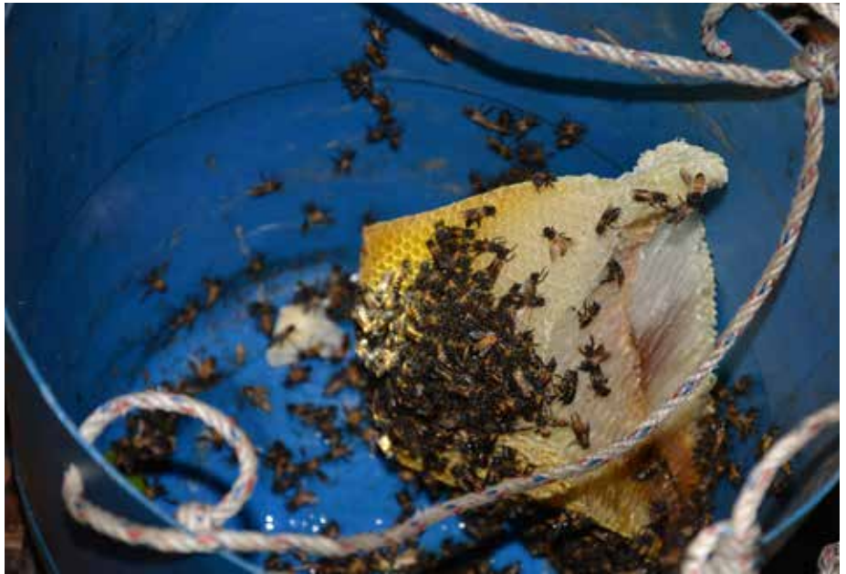
Above: Freshly harvested A. dorsata honeycomb

Oldroyd and Nanork (2009) outlined general strategies to address existing threats to