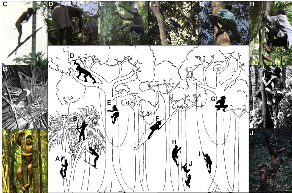
Figure 1. Center illustration: The locomotor and postural behavior of humans in trees (drawing by Annie Putman). (A) A man climbs a palm tree in French Guyana by linking his feet together with a rope (photograph by Serge Bahuchet, reproduced with permission). (B) A Batak man engaged in ambush hunting of a wild pig in the Philippines (photograph by James Eder, reproduced with permission). (C) A Yanomamö man in Venezuela uses two 'A-frame' devices to access the fruit of a peach palm (still frame from the film Climbing the Peach Palm (1974) by Timothy Asch and Napoleon Chagnon, reproduced with permission from Documentary Educational Resources). (D) A Biaka man in central Africa extracts honey from a bee nest in the canopy of an ~40 m tree (BBC Motion Gallery Education). (E) An Aka man climbs a large-diameter tree using a vine as a rope harness in the Central African Republic (photograph by Serge Bahuchet, reproduced with permission). (F) A Batek man in Malaysia bridges a gap between trees using small-diameter lianas (photograph by Kirk Endicott, reproduced with permission). (G) In southern India, a Jenu Kuruba man climbs a large-diameter tree in the chinbodn style, by inverting his ankles and hugging the trunk (photograph by Kathryn Demps, reproduced with permission). (H) In Uganda, a Twa man climbs a small-diameter tree in the changwod style in pursuit of honey (photograph by George H. Perry, reproduced with permission). (I) A Batak man in the Philippines climbs a vine by grasping the substrate with his big toes (photograph by James Eder, reproduced with permission). (J) Batek children climbing while engaged in play behavior (photograph by Kirk Endicott, reproduced with permission).

the Yuquí of Bolivia target the honey of native stingless bee species (Hawkes et al., 1982; Stearman, 1991; Stearman et al., 2008) and of introduced stinging bee species, primarily A. mellifera (Hawkes et al., 1982; Hill et al., 1984). The Achuar of Upper Amazonia, however, harvest honey only from native stingless bees and the Kayapo of the Brazilian Amazon maintain vast information on native bee species and prefer the honey those species produce (Posey, 1982). As in other geographic regions, in South America honey is a prized resource that often takes priority in foraging decisions (Hawkes et al., 1982; Chagnon, 1992).